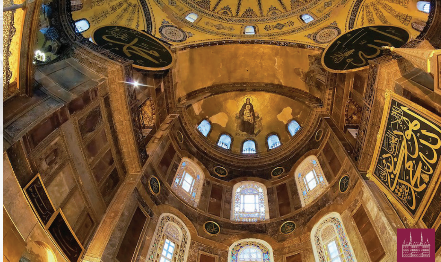
Photo: Hagia Sophia, Istanbul

The coexistence of Jews, Christians, and Muslims has a long tradition in Europe and the Mediterranean. In this multi-religious landscape, people have always shared certain sacred places.